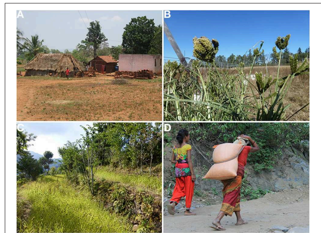
FIGURE 1 | Depictions of small millet cultivation. (A) A typical subsistence small millet farm in India where the crops are grown under low input conditions and valued for their high stress tolerance. Source: M. Raizada. (B) Finger millet seed heads nearing maturity at the University of Guelph in Canada. The seed heads resemble the fingers of a human hand. Source: T. Goron. (C) Finger millet growing in a terraced field on a smallholder farm in Nepal. Source: M. Raizada. (D) Drudgery associated with transporting grain in the rural areas of Nepal. Source: M. Thilakarathna.

intensive grain cropping monocultures. Many reports also exist regarding their high degree of pest resistance and long-term storability, both traits which make the cultivation of small millets good insurance against famine and crop failure (Tsehaye et al., 2006; Reddy et al., 2011).